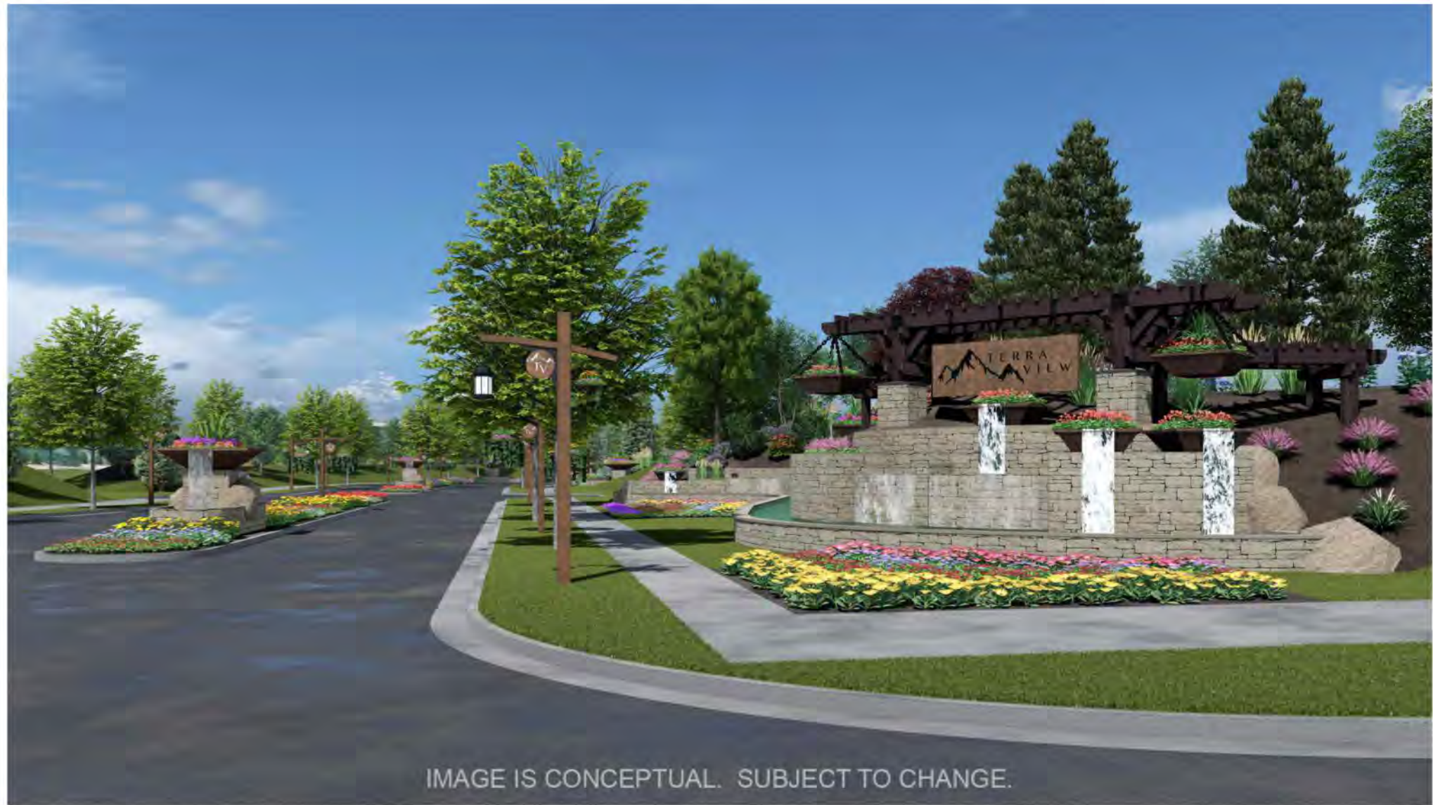
IMAGE IS CONCEPTUAL. SUBJECT TO CHANGE.