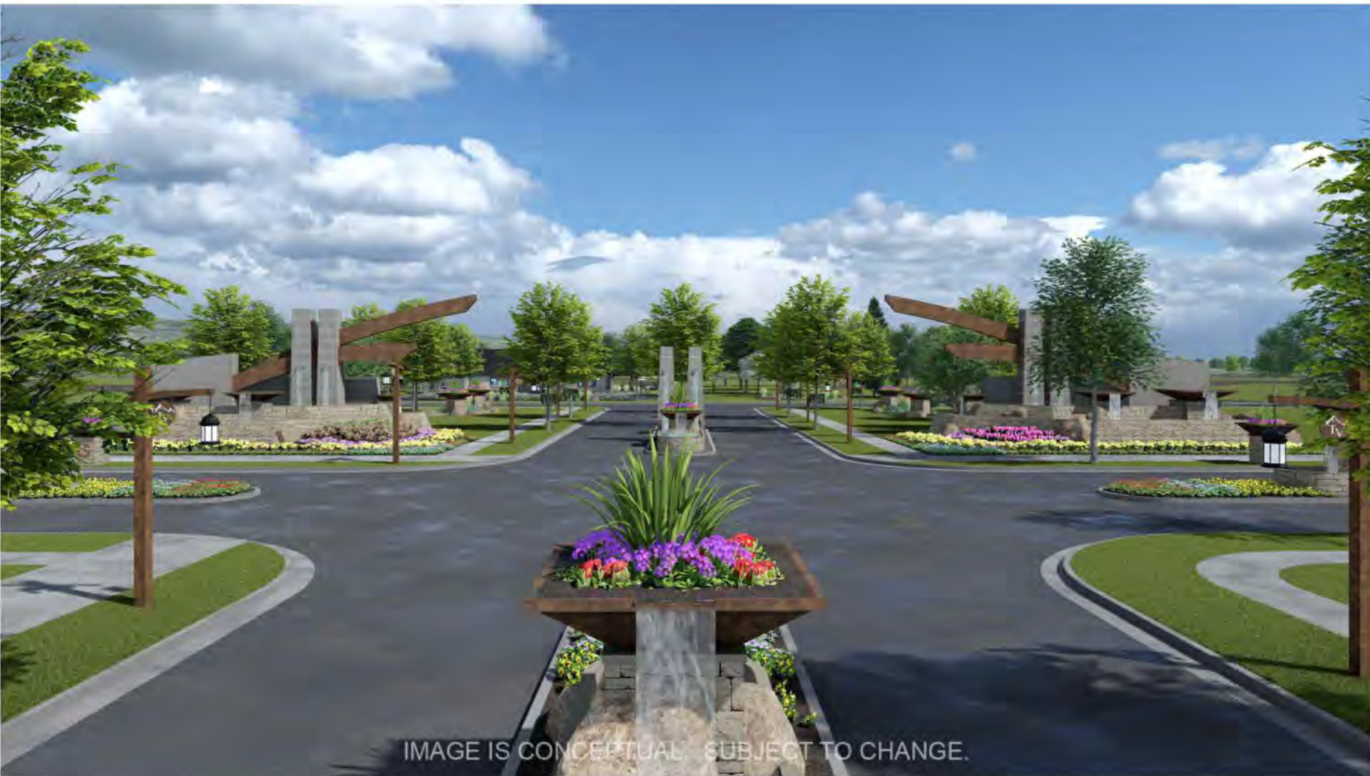
IMAGE IS CONCEPTUAL. SUBJECT TO CHANGE.